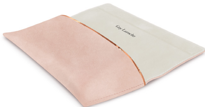
WOMAN CASE PGL