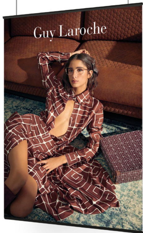
DOUBLE SIDE POSTER PGL1163