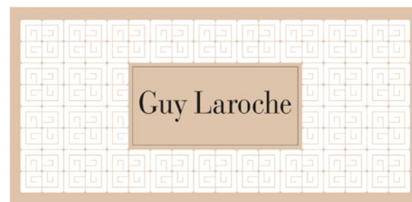
LINEAL SHOWCARD MP1182