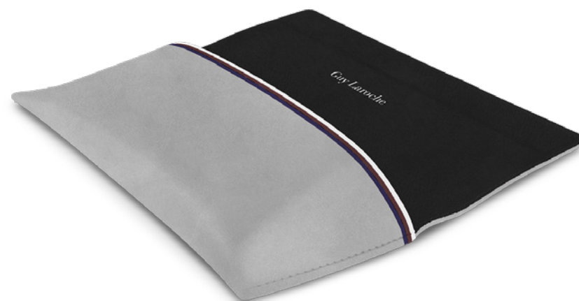
MAN CASE PGL