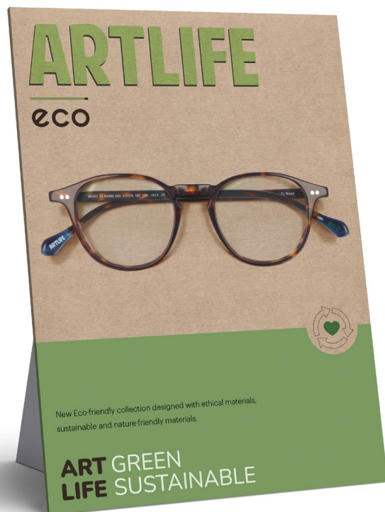
Showcard 29x40cm PAL1119