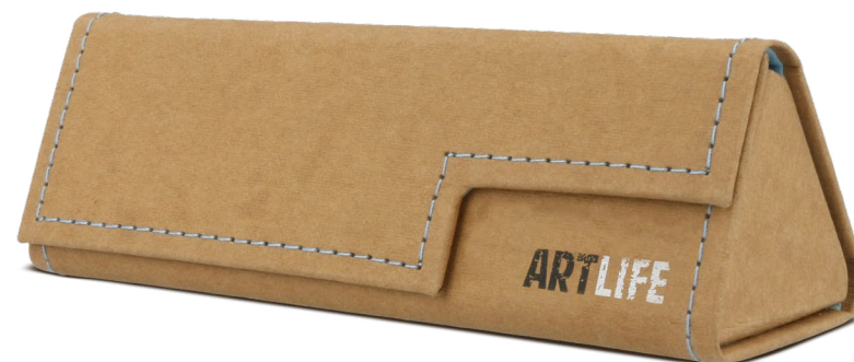
Case Estuche AL