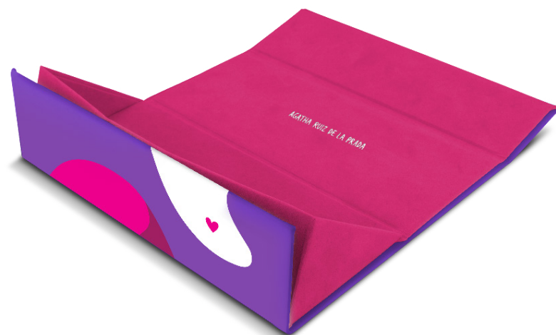
WOMAN CASE ESTANV21