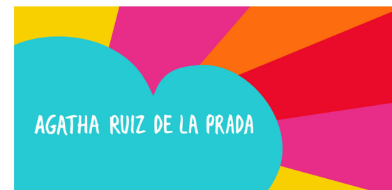
LINEAL SHOWCARD MP1181