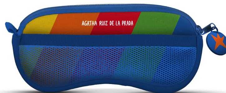
KID CASE ESTANV21